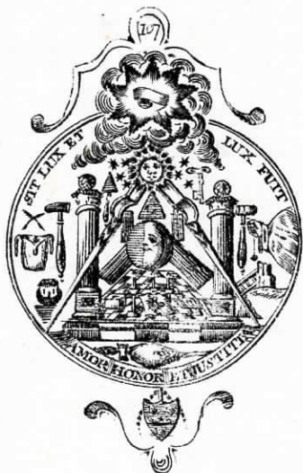
Craft Emblems and Arms of the Owens